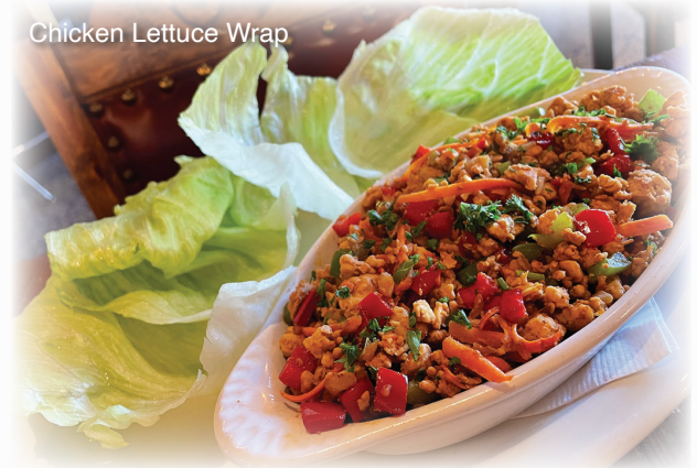
Chicken Lettuce Wrap

Spicy fried spring rolls with sesame chicken, cabbage, carrots, sprouts and sweet chili sauce.